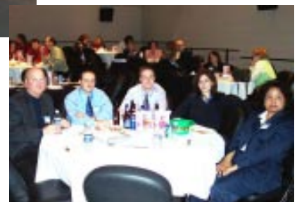
The Fulton County Gang