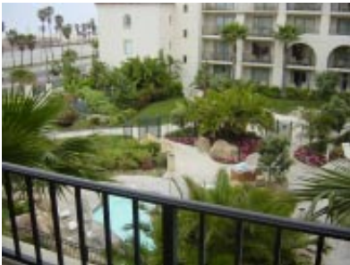
Our Inspiring View