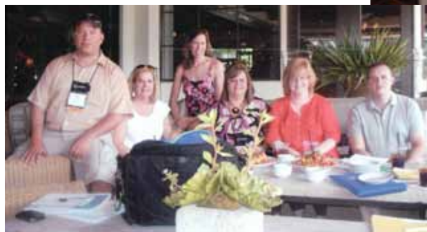
Work, Work, Work