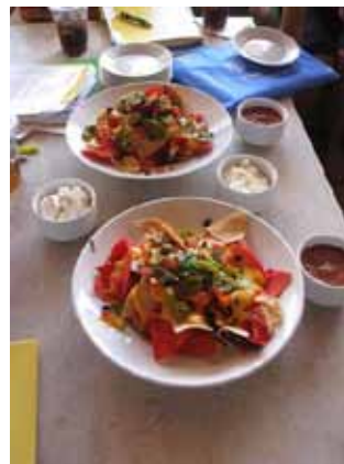
Needs no explanation