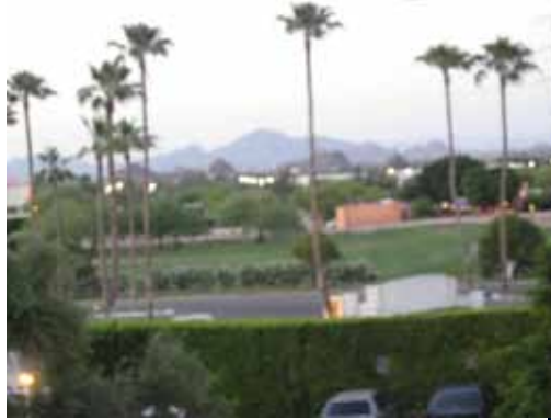
Arizona mountains in the morning