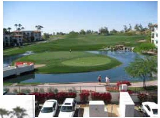
Beautiful view of the Arizona Grand Resort

In addition to the informative sessions, it was great to just hang-out with the other members of the chapter leadership team whether it was by the pool, at a relaxing dinner, or while driving around lost trying to get to the restaurant. LTC is a great way to bond with fellow chapter volunteers and provides excellent growth opportunities in the chapter as well as professionally. It's a very nice perk of chapter leadership too!